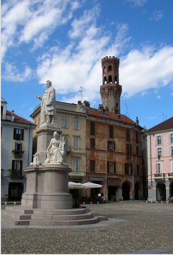
Cavour Square, the centre of the city.